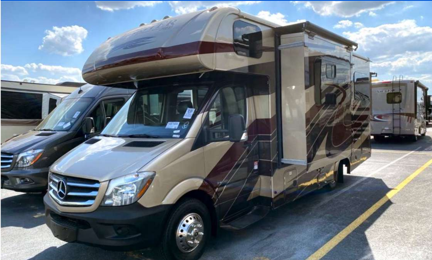
2017 Forest River FORESTER 2401R