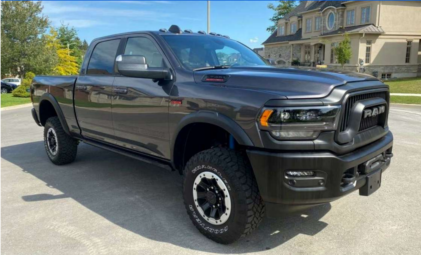
2021 Ram 2500