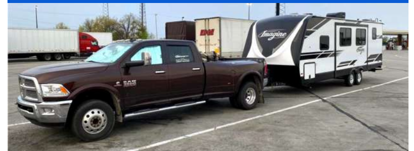
A home car